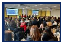
Economic Trends of the Finance Industry, Careers and Diversity in Leadership hosted by EY