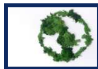
Nature and Biodiversity Risk Reporting