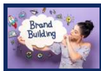
How to Build your Personal and Professional Brand