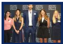
Diversity in Trading: Emerging Trends in a Post-COVID Era, hosted by Commonwealth Bank Australia

Take a look at some of our events this year. WiBF held 8 in-person events from Jan–September 2023.