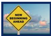
New Beginnings: A Roadmap for Starting the Year Strong