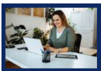
Leading the Way: Mastering Leadership in Hybrid Roles